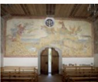
Painting on the back wall in the lower Ranftchapel